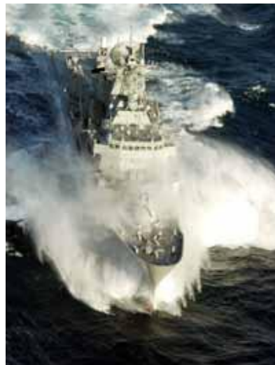
HMNZS Te Kaha

My son and I visited the ships on Sunday October 2 nd and did a tour of the HMNZS Rotoiti. The sailors spend up to sixty days on these boats, which is a long time on a relatively small vessel. The Rotoiti is the same as the Pukaki as mentioned above and is relatively small with some very steep sets of stairs inside.