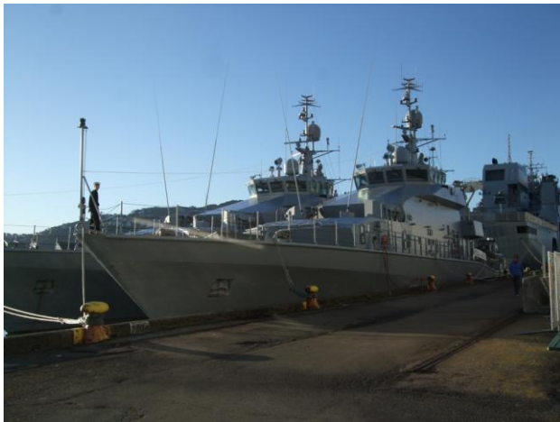
The Pukaki and Hawea

My son and I visited the ships on Sunday October 2 nd and did a tour of the HMNZS Rotoiti. The sailors spend up to sixty days on these boats, which is a long time on a relatively small vessel. The Rotoiti is the same as the Pukaki as mentioned above and is relatively small with some very steep sets of stairs inside.