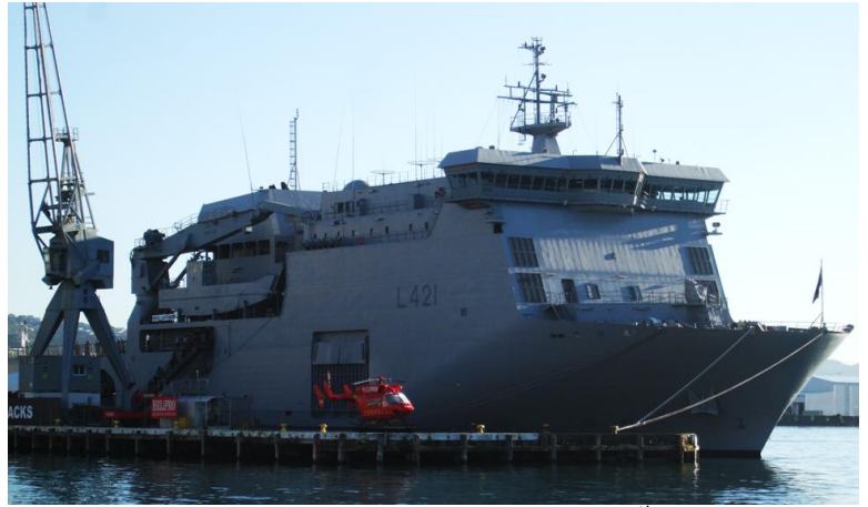
HMNZS Canterbury berthed at Wellington 30 th September

The RNZN came to town at the end of September to celebrate their 70 th Anniversary. Eleven ships in total berthed in Wellington Harbour, this is a rare event and not one this editor has seen before. Pictured to the right is the HMNZS Canterbury, she is primarily a troop and support carrier, capable of transporting two helicopters. She also has several boarding vessels which can be deployed very quickly. The Canterbury is 9000 tonnes displaced and 131 metres in length and can carry up to 360 troops at one time.