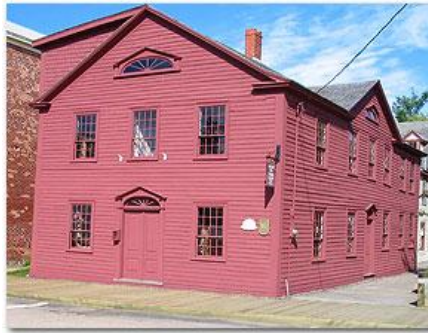
Sinclair Inn – Nova Scotia