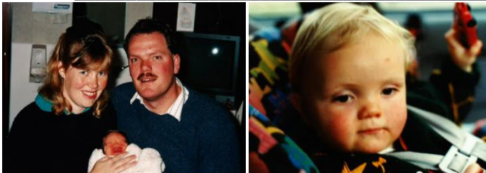
Cameron 2 Days